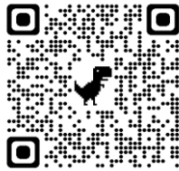
Setting the table